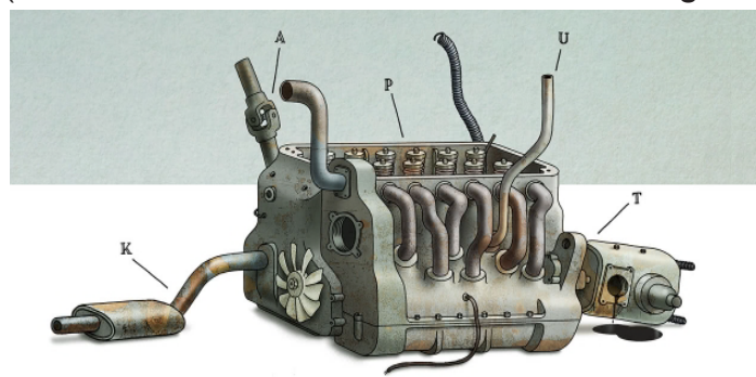
Fig. 1 The Internal Combustion Engine